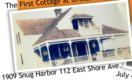
1909 Snug Harbor 112 East Shore Ave.