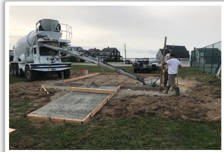
Shaded Pavilion in the works!

We are now in the first stages of construction for the Shaded Pavilion. The Clark Hall Renovations will begin on January, 15 th 2021 with a finish date in April.